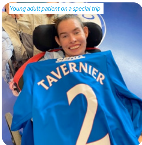
Young adult patient on a special trip