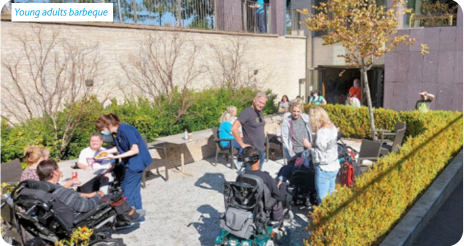
Young adults barbecue

"I got to do loads of activities including art and I played games with the other patients. We started a game of Dungeons and Dragons which is like role playing and the game doesn't really end, it just continues with the story. I am really looking forward to continuing this game and also using the projector on my next stay."