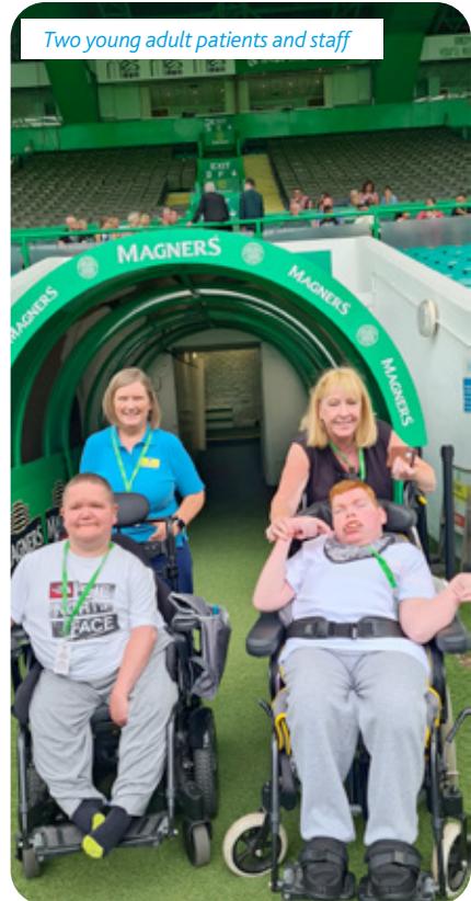
Two young adult patients and staff